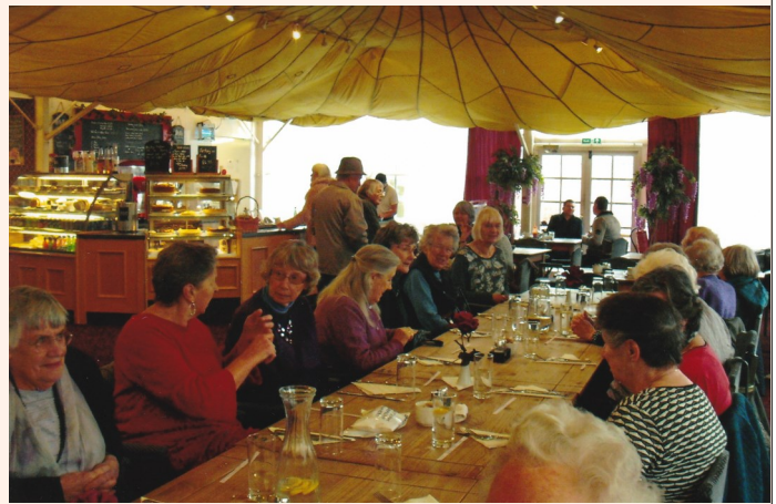
Our 2017 New Year Lunch

Meeting time: 2nd Tuesday of the month at 2.00pm Venue: Baptist Church Rooms, Homend, Ledbury