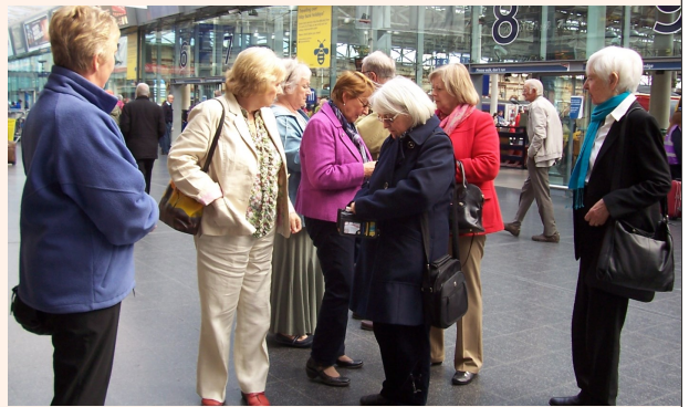
On Manchester Station looking for pennies