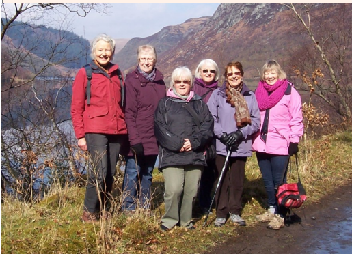
Walking in the Elan Valley

Next Month's Spotlight article will be on PENCOMBE & LITTLE COWARNE