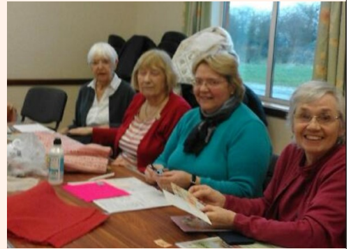
New member's second meeting