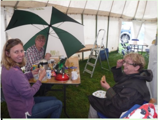
A very wet build up day

Thank you very much for all your help to make a very successful Royal Three Counties Show for our Herefordshire WI federation