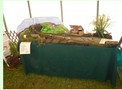
SATELLITE GROUP - July