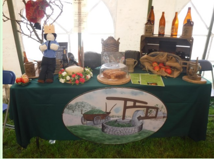
BROMYARD GROUP January/February