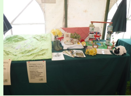
KIMBOLTON GROUP - April