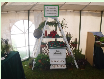
GOLDEN VALLEY GROUP - June