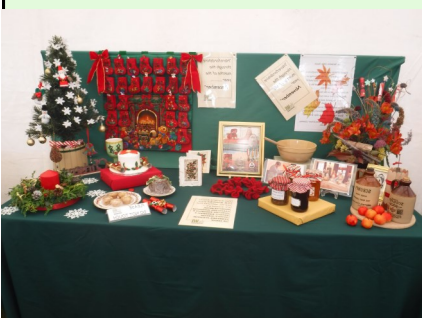
THE MARCHES GROUP - November/December