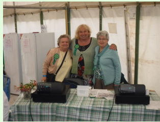
The Tiller Girls