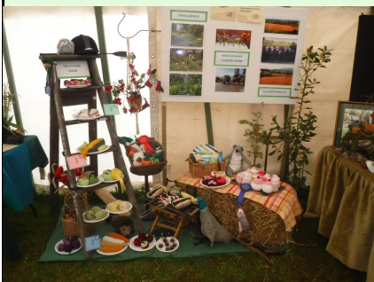
HOLMER GROUP - August