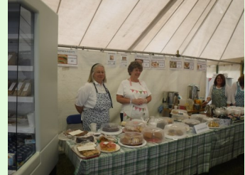
Cakes, cakes, cakes cakes ....