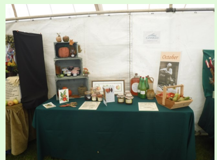
LEDBURY GROUP - October