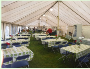
Eating area in the Marquee