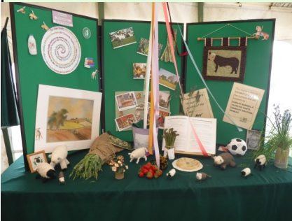
WEOBLEY GROUP - May