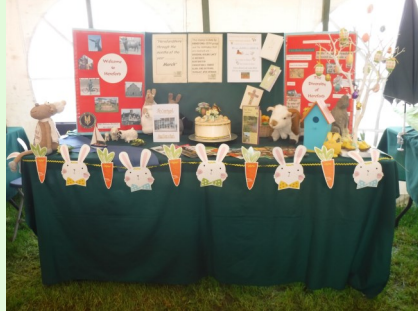
HEREFORD CITY AND FOWNHOPE GROUP - March