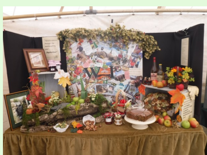
ROSS AND DISTRICT GROUP - September