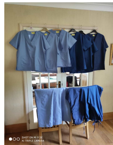
Val Lewis, first set of scrubs waiting to go