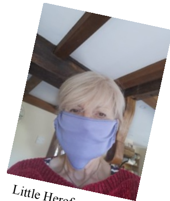
Little Hereford WI