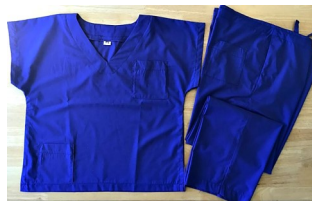
Scrubs & Gown, Saltmarshe & District WI