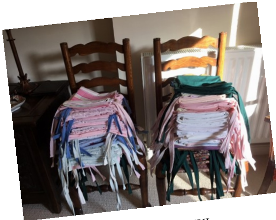
Scrub Bags - Putley WI