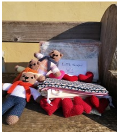
Teddies & bags, Little Hereford WI