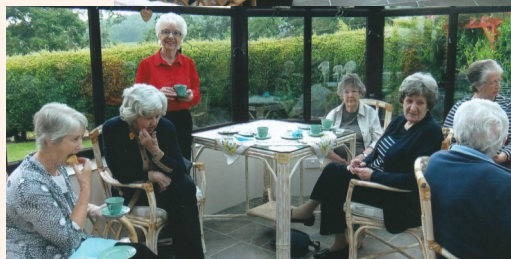
Coffee morning for Denman