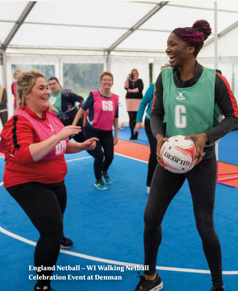
England Netball – WI Walking Netball Celebration Event at Denman