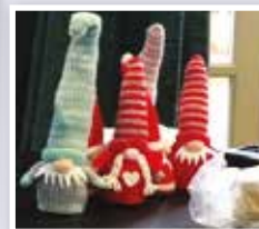
Gnomes & Tree hoop decorations.