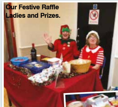
Our Festive Raffle Ladies and Prizes.