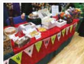
YULE FAYRE P - 4