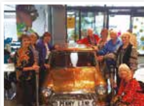
A RIGHT ROYAL VISIT P - 3